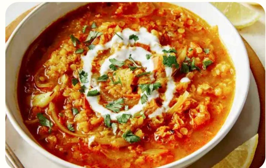
Red Lentil Soup