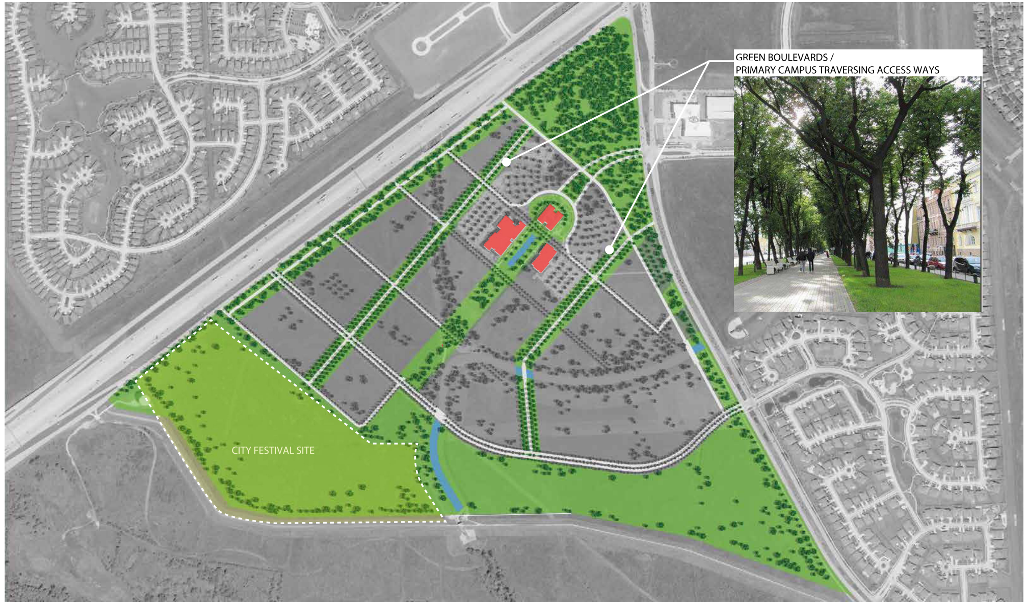
GREEN BOULEVARDS / PRIMARY CAMPUS TRAVERSING ACCESS WAYS