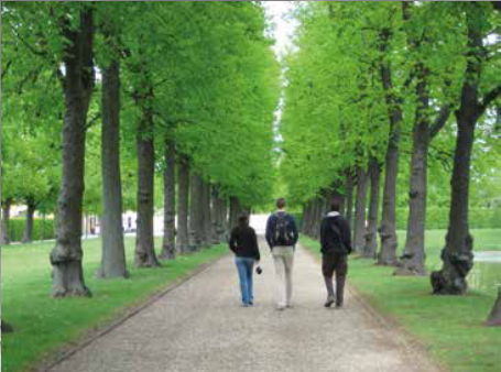
LATERAL GREEN ARTERIES PEDESTRIAN ONLY ACCESS WAYS