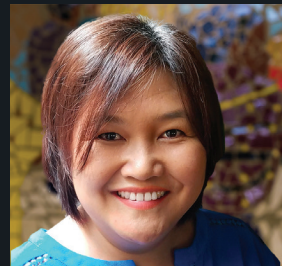
Despite recent advances in understanding barriers to Hispanic health services utilization, Hispanics continue to be over-represented in low service utilization groups