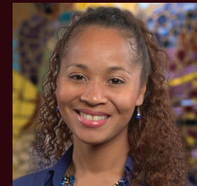
The child welfare system in the United States is characterized by racial disproportionality and disparity for African American children at every decision point. Research on the

predictors of child welfare system involvement and their influence on levels of disproportionality has focused overwhelmingly on individual-level risk factors.